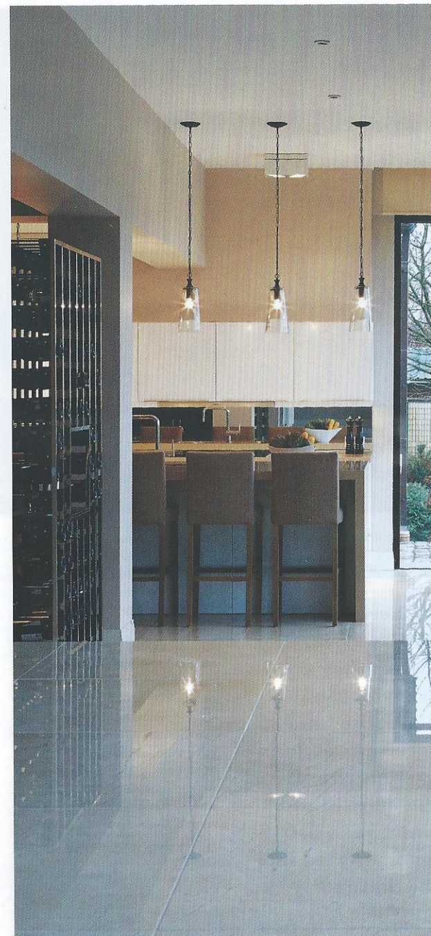
Above: Belgian Farmhouse project. The hallway to kitchen view