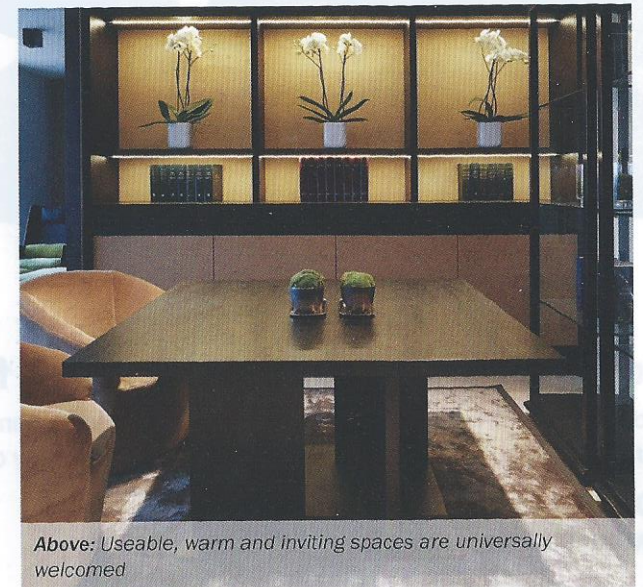
Above: Useable, warm and inviting spaces are universally welcomed

After that, my own company really took off. Thanks to the fact that I have lived and worked in different countries, I already have an international perspective on clients and designs. With a farmhouse completed in Belgium, four projects in Kiev and one in India, I have learnt quickly how design and the challenges it creates with tradesman and logistics differs from country to country. But there is one constant