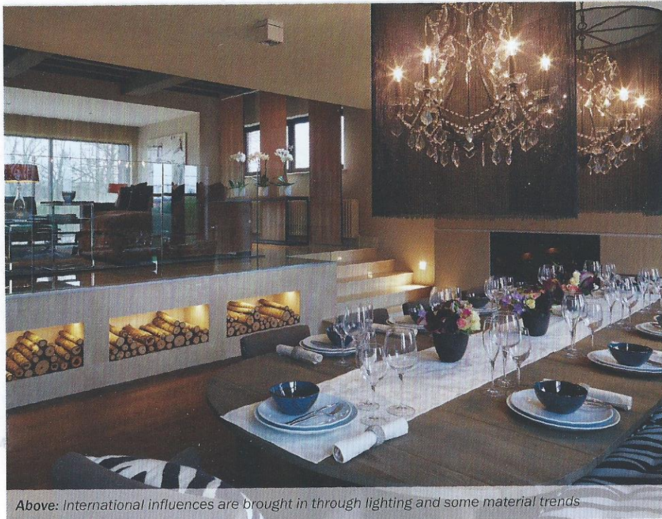
Above: International influences are brought in through lighting and some material trends

- the one thing all my clients are looking for is a home with five-star style and services.