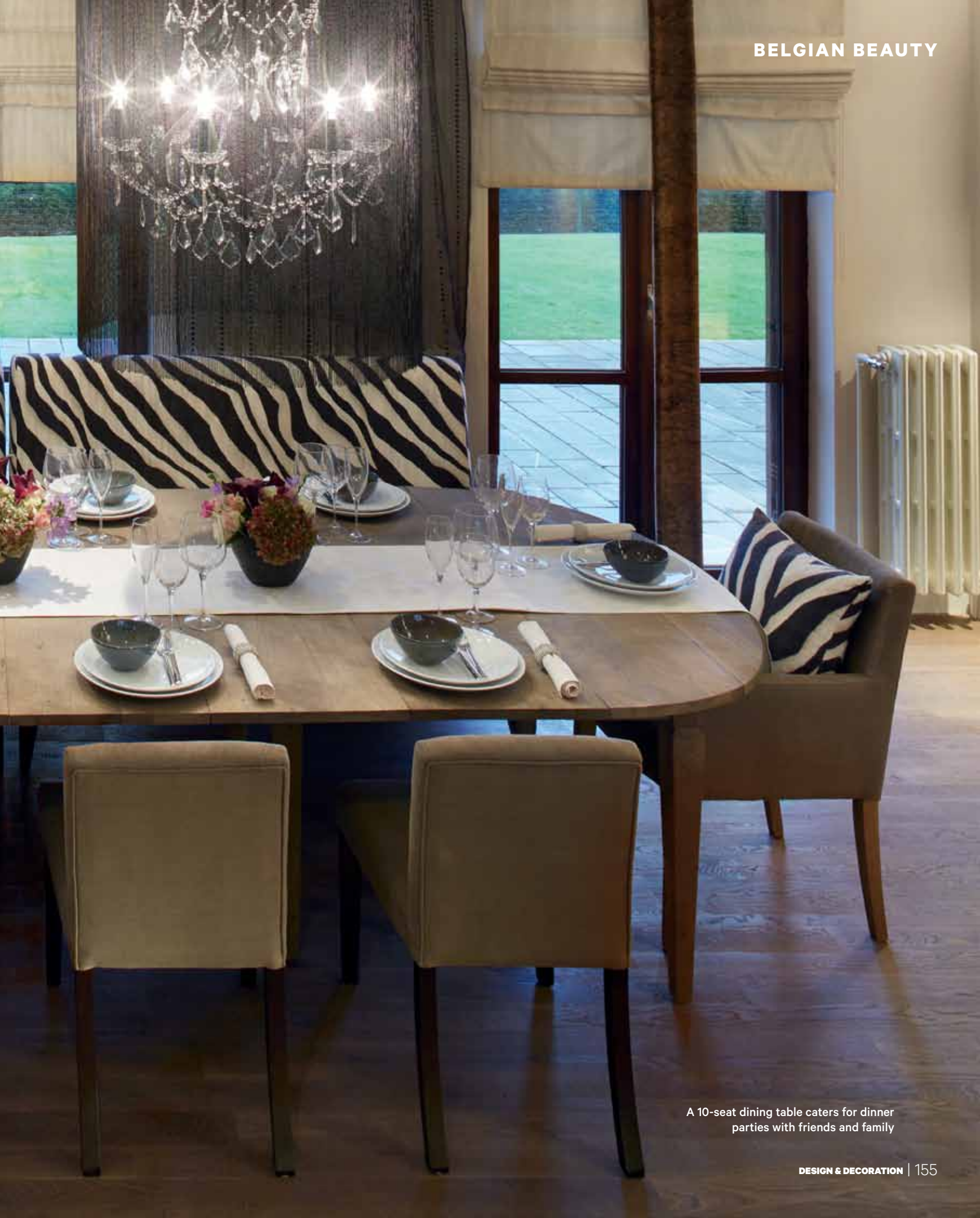
A 10-seat dining table caters for dinner parties with friends and family