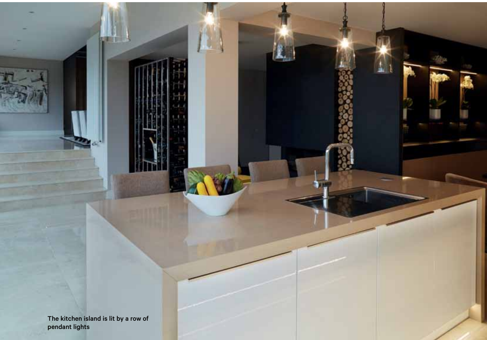
The kitchen island is lit by a row of pendant lights