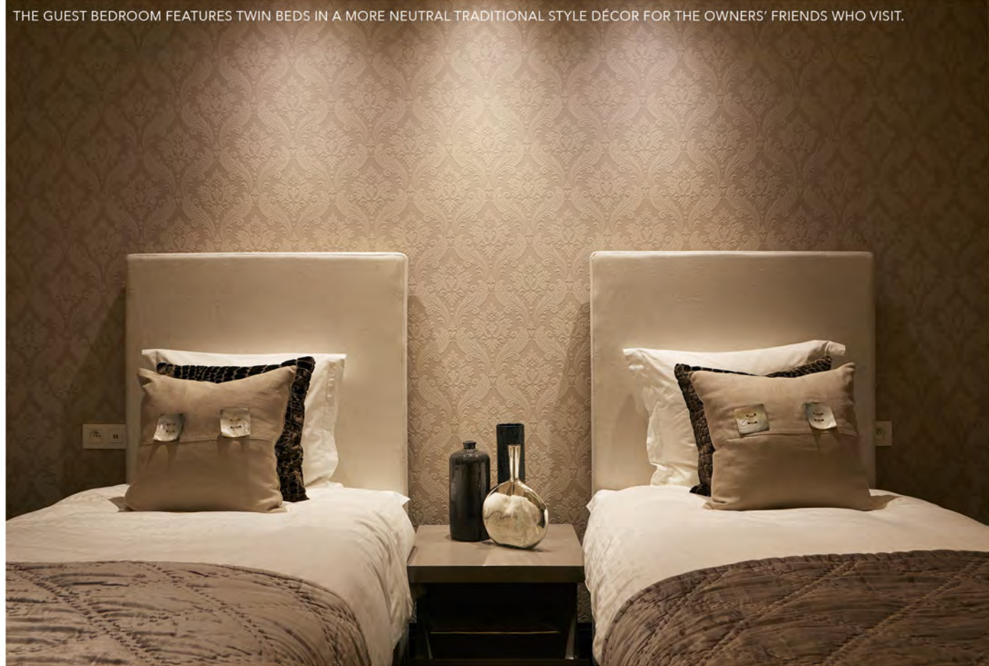
THE GUEST BEDROOM FEATURES TWIN BEDS IN A MORE NEUTRAL TRADITIONAL STYLE DÉCOR FOR THE OWNERS' FRIENDS WHO VISIT.