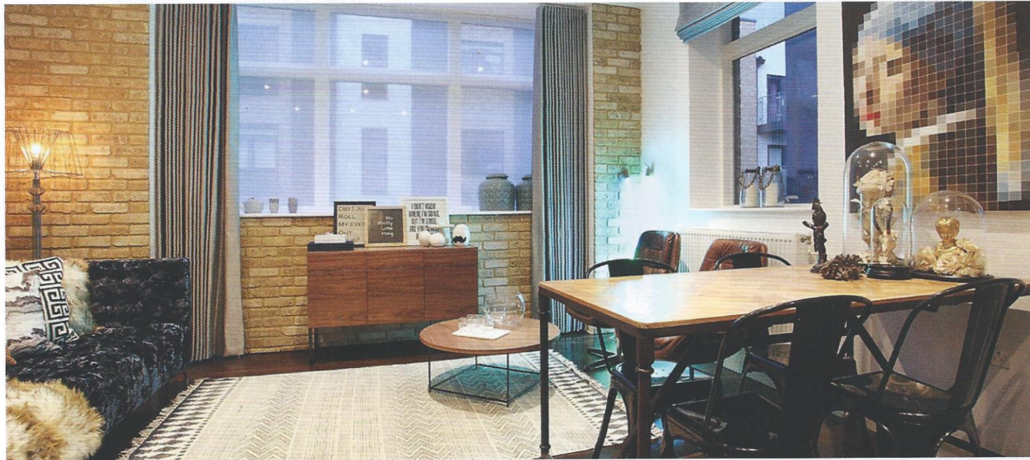
The Joinery Living Room for Family Mosaic by Suna Interior Design

WHAT ARE THE MOST POPULAR REQUESTS FROM CLIENTS WHEN CREATING DINING AND LIVING SPACES?