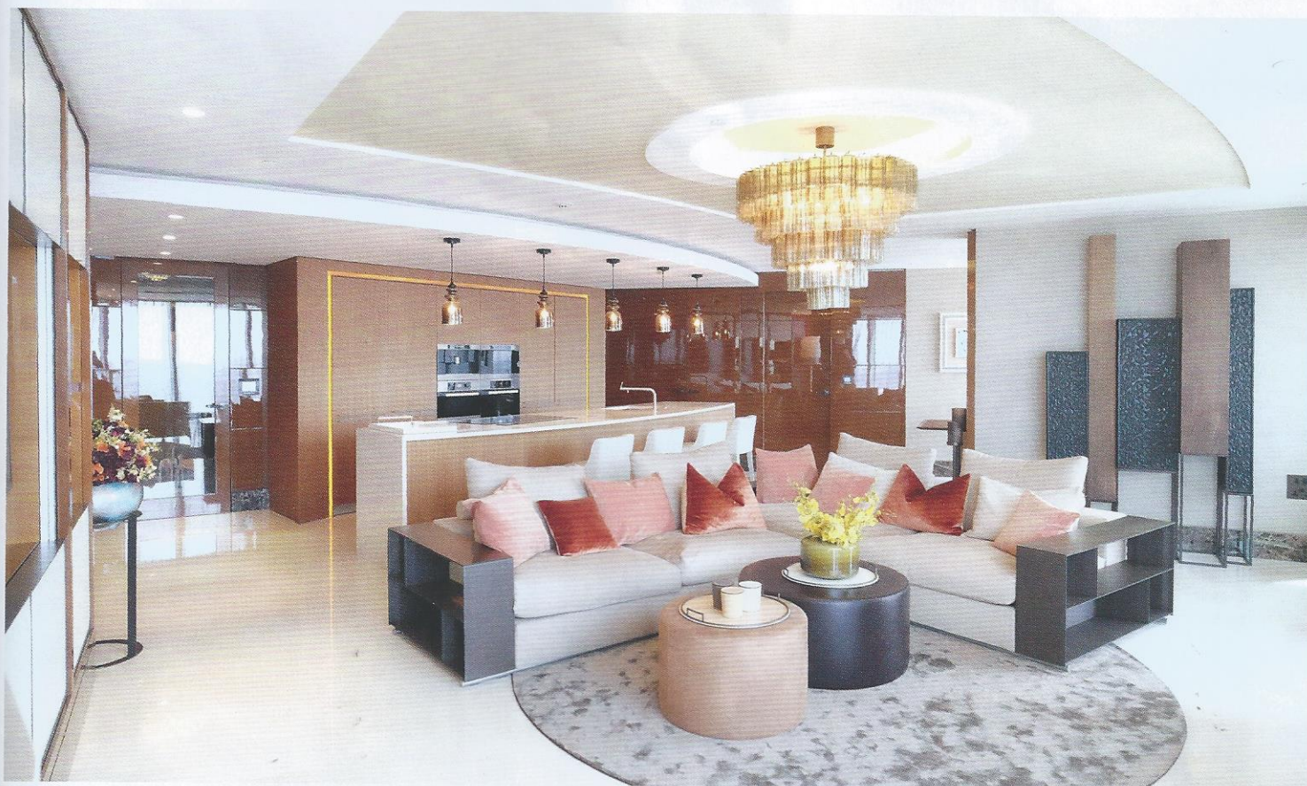
Vauxhall Penthouse by Keir Townsend